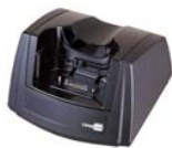
Charging and communication cradle/ Ethernet cradle